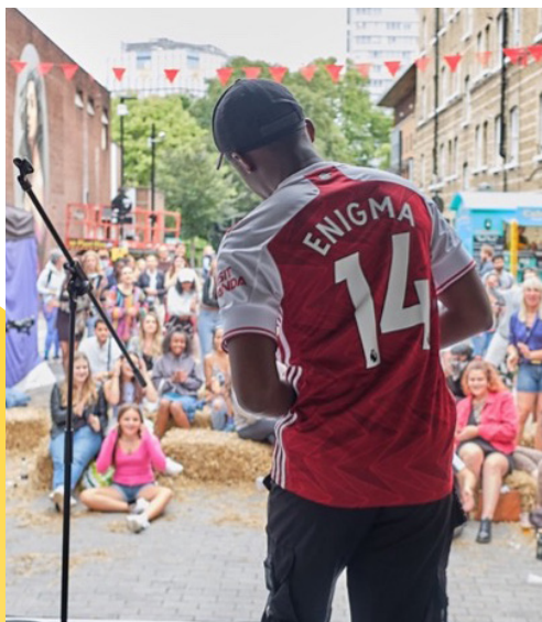
Our Whitecross Street Party gives local young people a platform and a voice.