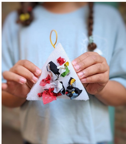
Children enjoy making bunting at our annual Whitecross Street Party in Islington.